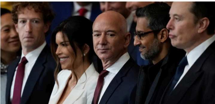
Jeff Bezos at the 2025 Presidential Inauguration. He is surrounded by some of the most prominent tech billionaires in the country.

DEI stands for Diversity, Equity, and Inclusion. It is basically an approach that organizations, schools, and communities use to make sure everyone regardless of their background, race, gender, abilities, or other differences has a fair shot at opportunities and feels valued. Diversity is about having a mix of people from different backgrounds, experiences, and perspectives. Equity means making sure that everyone has what they need to succeed, which isn't always the same for everyone. Its different from equality because it recognizes that some people may need extra support to have the same opportunities. Inclusion is about making sure that once diverse people are present, they feel welcomed, heard, and truly part of the group. So, in simple terms, DEI is supposed to be about making workplaces, schools, and other spaces more fair and welcoming for everyone.